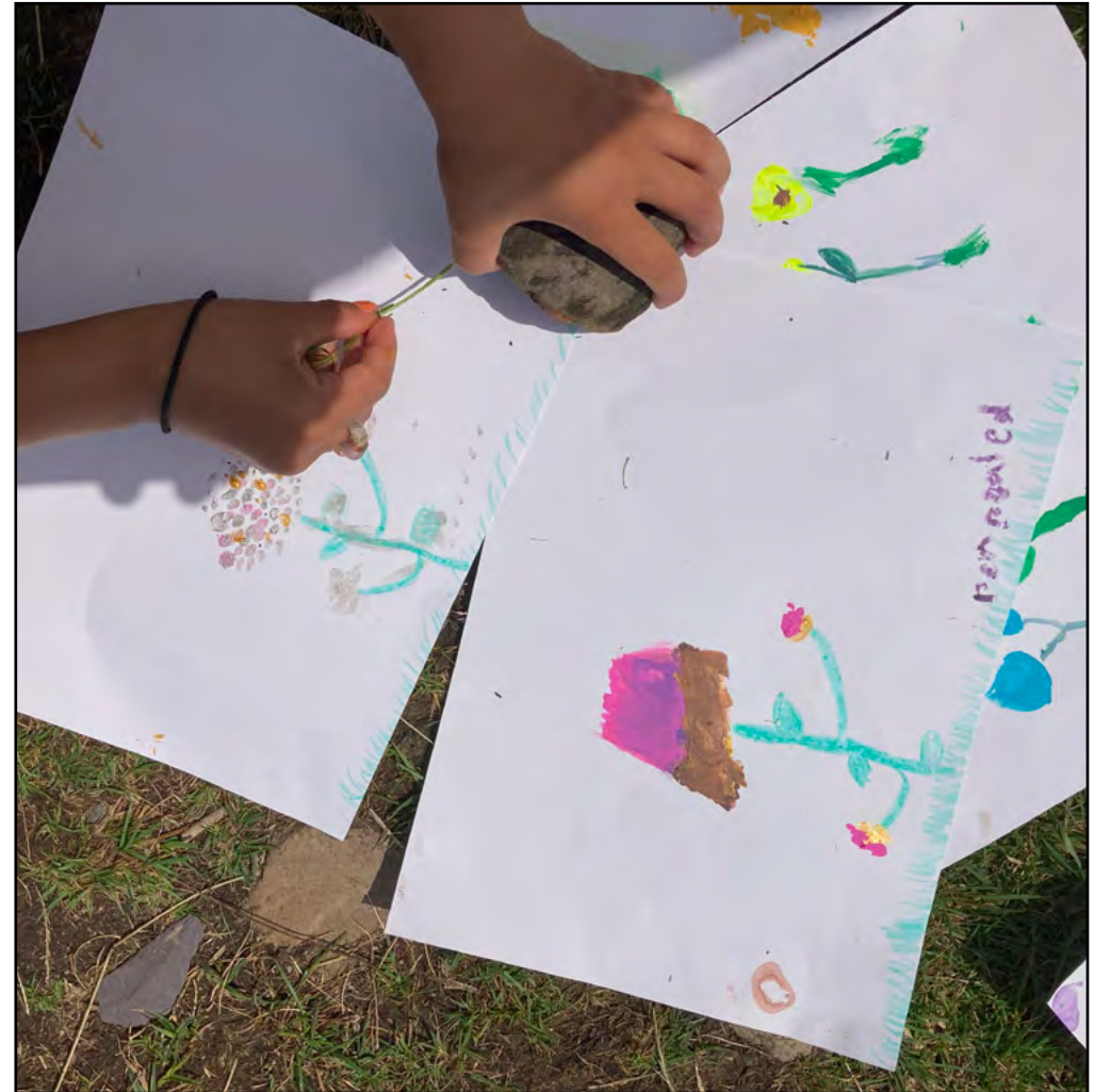
Wild Flower Treasure Hunt, Baladeulyn

This website could help you track the volunteer hours given to the project: www.volhours.com