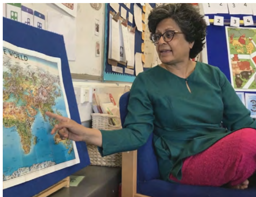
Cynefin: Culturally and Ethnically Diverse Wales, Creative Learning Programme