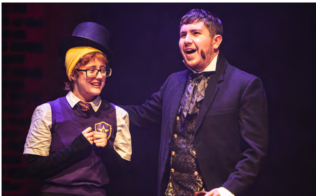
HUMBUG! , Hijinx community theatre group Odyssey’s Christmas show.

The consultation included exploration of the core principles that would underpin the review and our proposed approach to application and future funding models. Widening Engagement was one of the core principles that would be at the heart of future investment in the arts. The application process closed on 31st March 2023 and 140 applications were received. The assessment process was due to begin in mid-April 2023 and conclude with a meeting of the Council in the September.