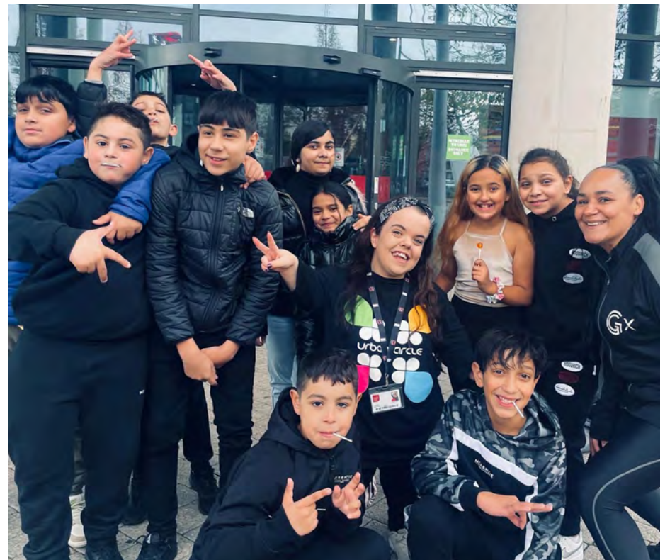
Urban Circle

“The Creative Steps programme helped to develop our 1st draft of our business plan, create the right organisational structure (reincorporate G-Expressions) model and financial plan to help us grow and address the needs of the young people in Newport sustainably.”