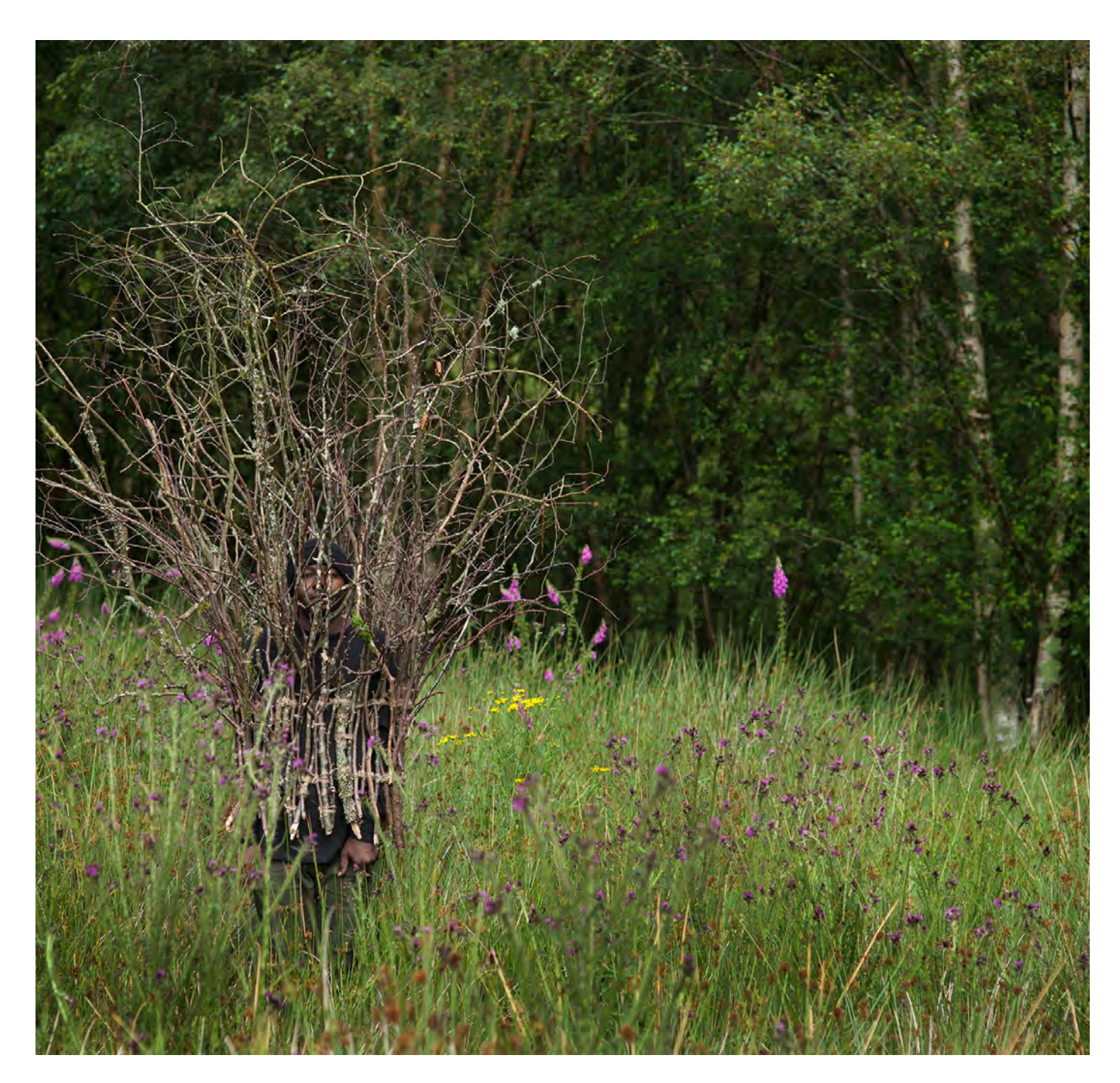
Xenson @ Egin Artists Residency