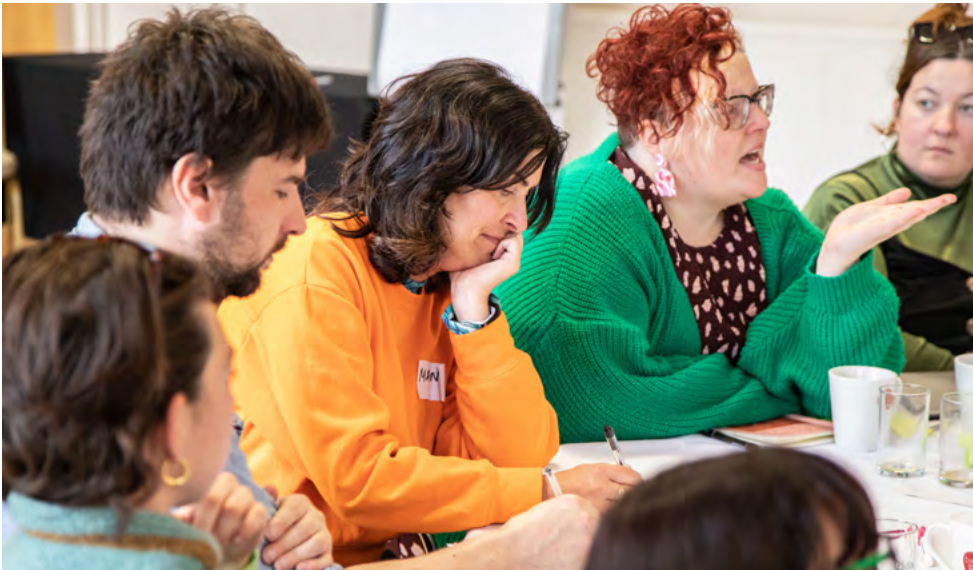
Sharing Day

We are looking for ideas that will discover creative ways to operate and lay a solid basis to develop for the future. We want applications that will be creative and proactive in addressing the question.