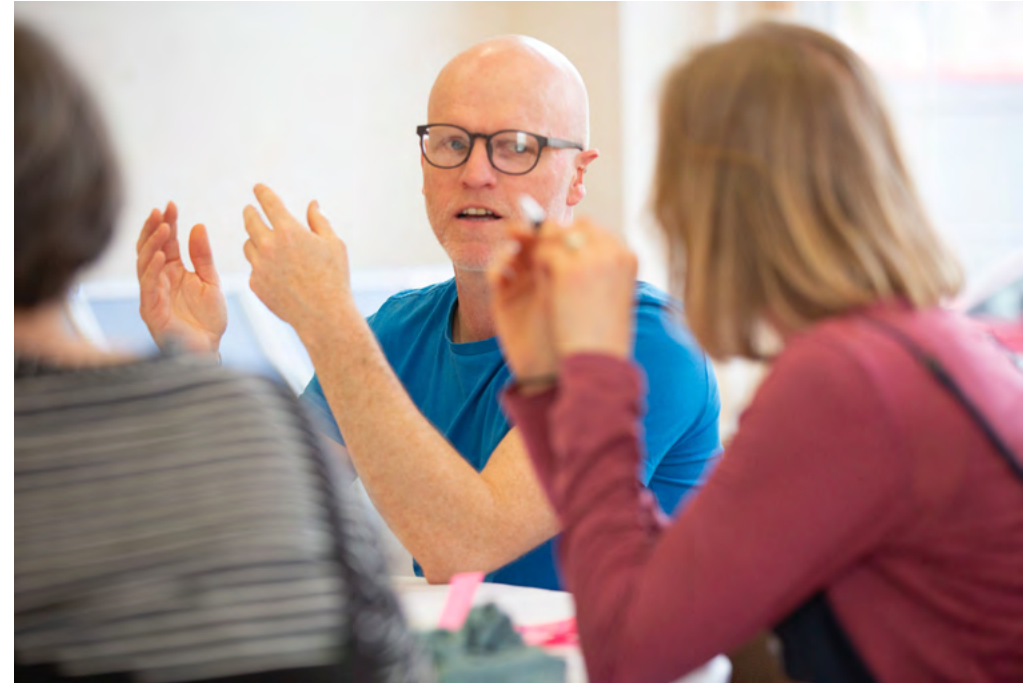
Sharing Day

The aim is to explore a new approach to long term funding for creative individuals and communities. Using lottery funding to create an open call out which will explore possibilities with a strong emphasis on research.