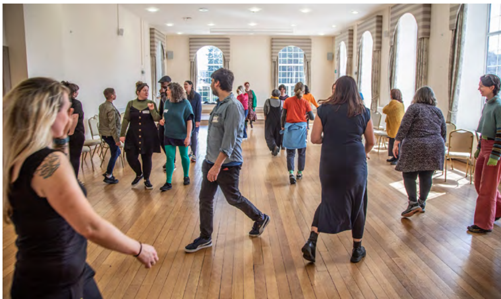
Sharing Day

We won't fund an application where there's no fee for yourself or your colleagues or there's only a very, very low fee in the budget. We would like to see that you have referred to industry standards rates that apply to your practice and you should at least pay minimum industry rates. Where minimum industry rates are not available, you must pay at least the National Living Wage.