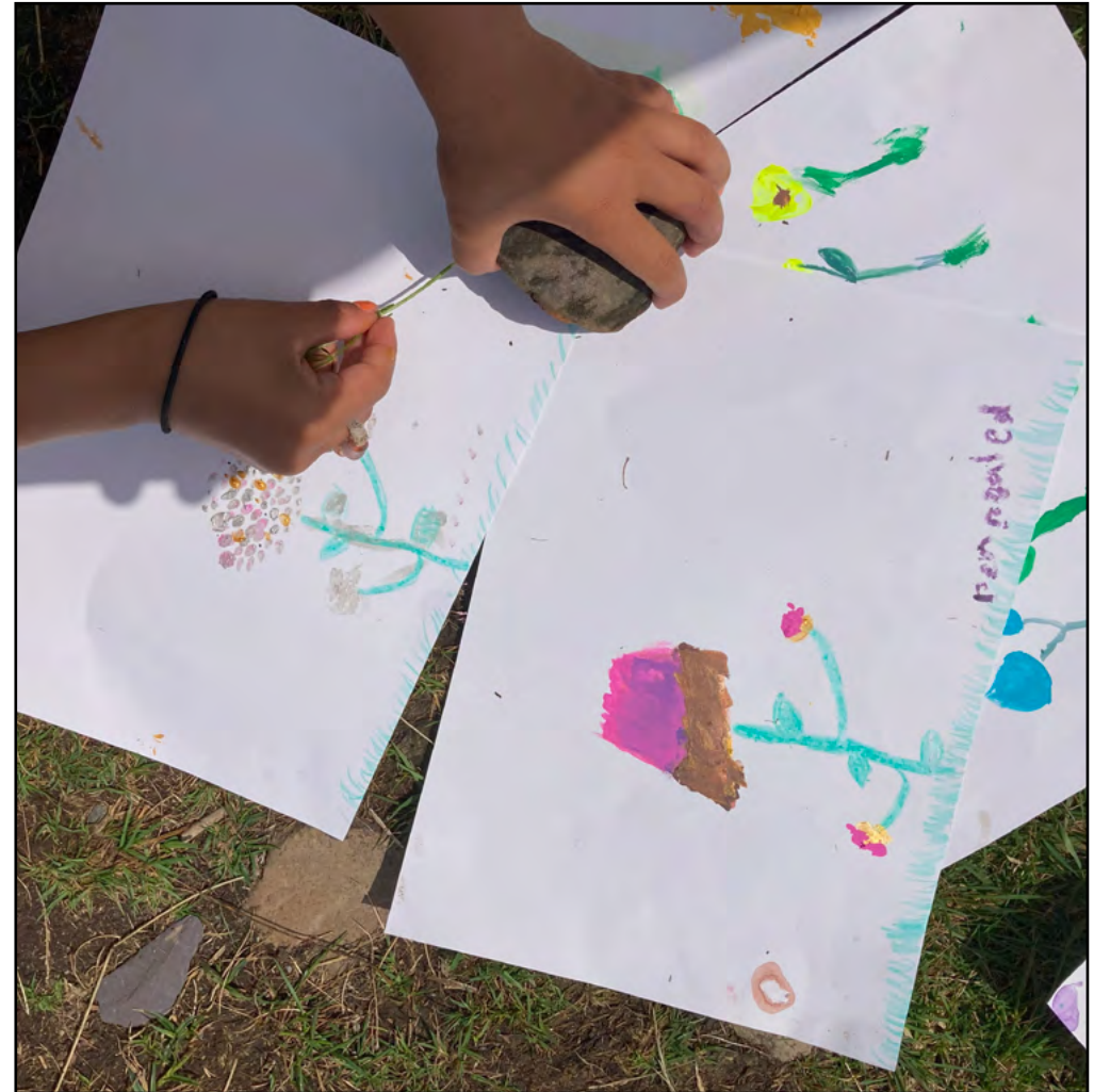
Wild Flower Treasure Hunt, Baladeulyn

This website could help you track the volunteer hours given to the project: www.volhours.com