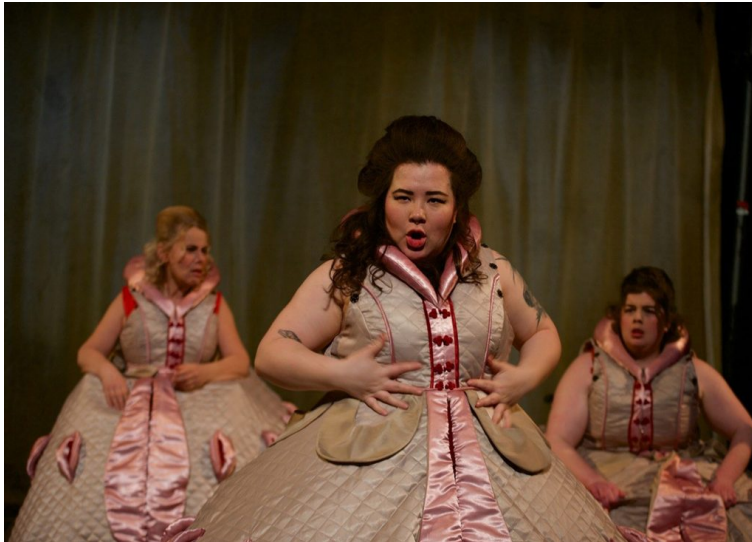
Peeling by Kaite O'Reilly, Taking Flight Theatre