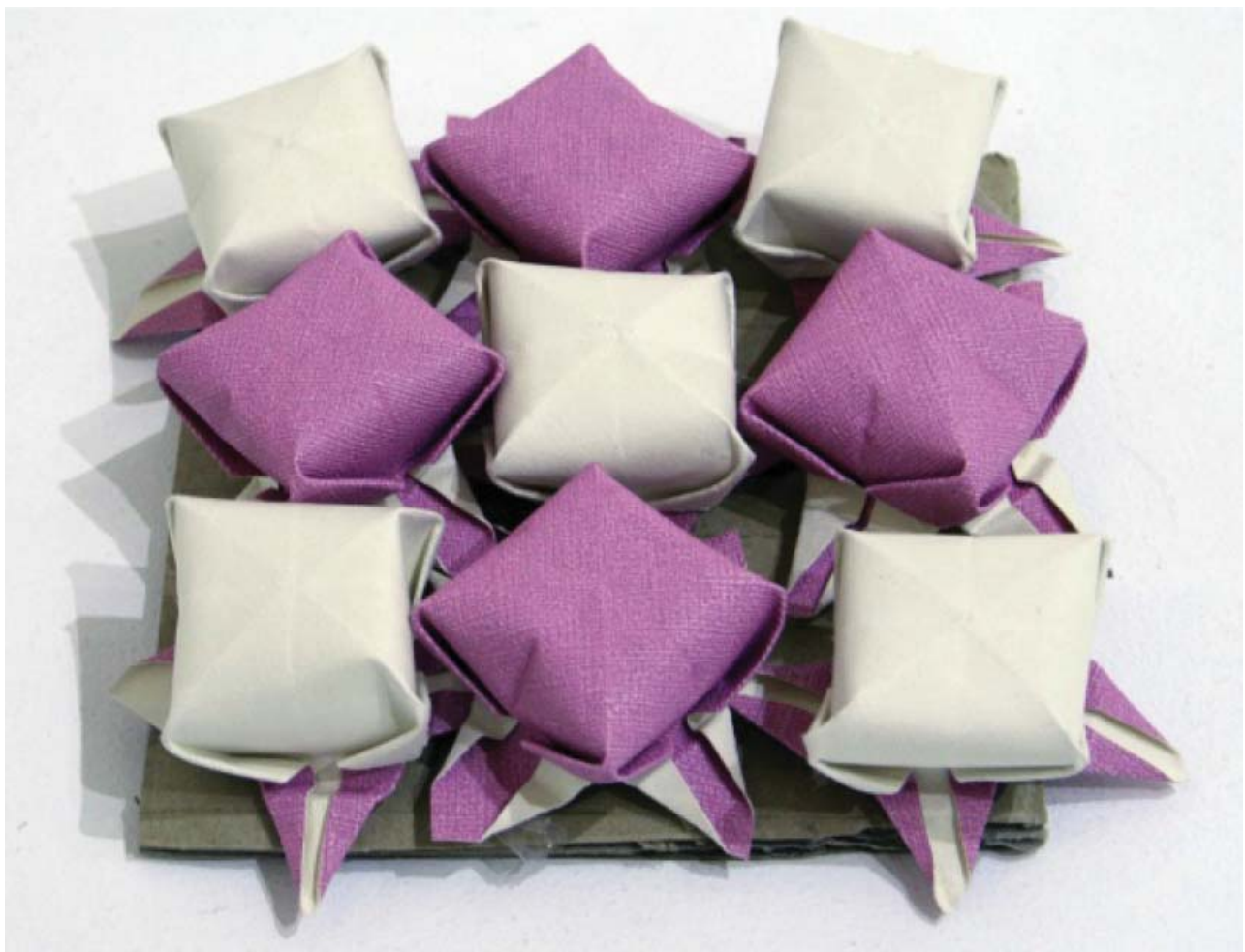
Work by Criw Celf, Neath Port Talbot and Carmarthenshire participants exhibited at Mission Gallery

Parents will be well placed to give feedback on how their child's confidence and aspirations in relation to their artwork and ambitions related to the visual arts have changed (See Tool 9 page 17).