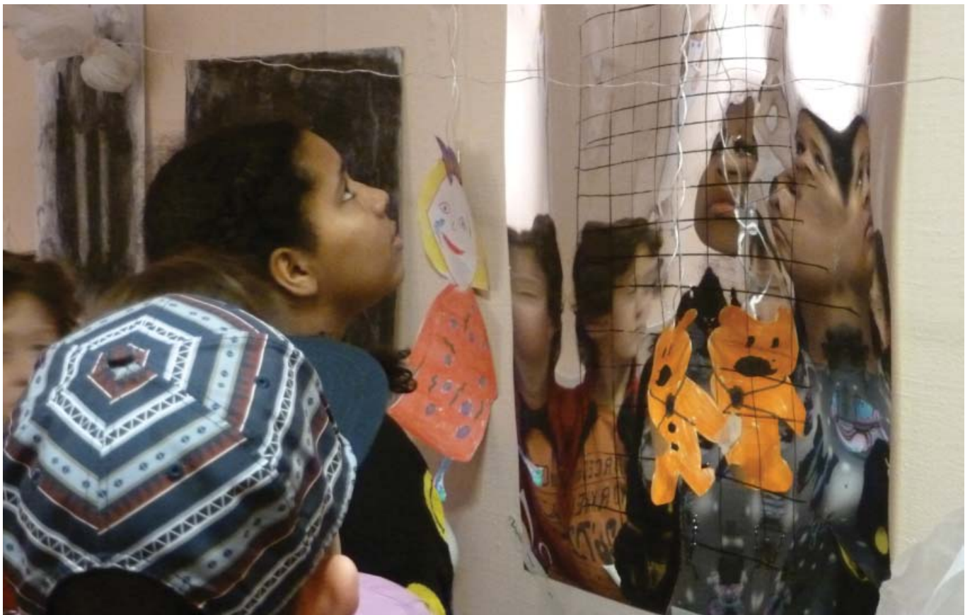
Criw Celf at Oriol Myrddin Gallery