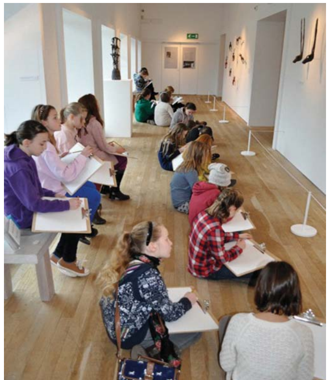
Criw Celf at Ruthin Craft Centre

The visual story of Criw Celf is vital too, so images and short films that you may have created during the programme to support evaluation and to help demonstrate the outcomes should be submitted along with the report.